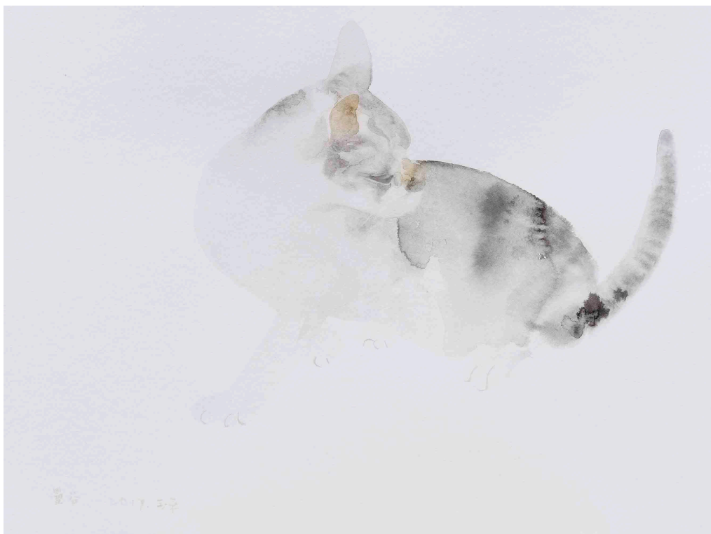
Cat 2 , Watercolour on paper, 42 x 56 cm, 2018 貓 2，紙本水彩，42 x 56 cm，2018

In this body of work on Thailand, he chose to use acrylic and oil pastel on canvas, as well as paper. His casual, detached images bring us back to vacation. Paintings (figures), like words, are visible, and when people look at the paintings, it's like looking at the figures. The figures exist in these two-dimensional paintings, but we are actually looking into the depths, the depths of memory.