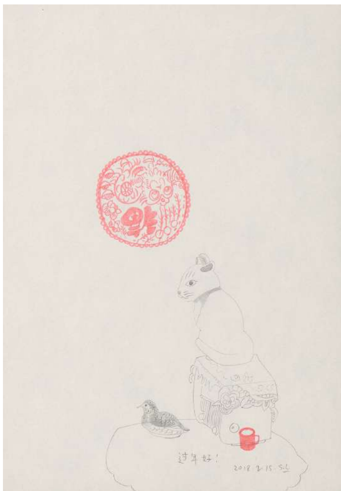
Ephemeral , 29.7 x 21 cm, pencil on paper, 2015 – 2018 《朝露》, 29.7 x 21 cm, 紙本鉛筆, 2015 - 2018