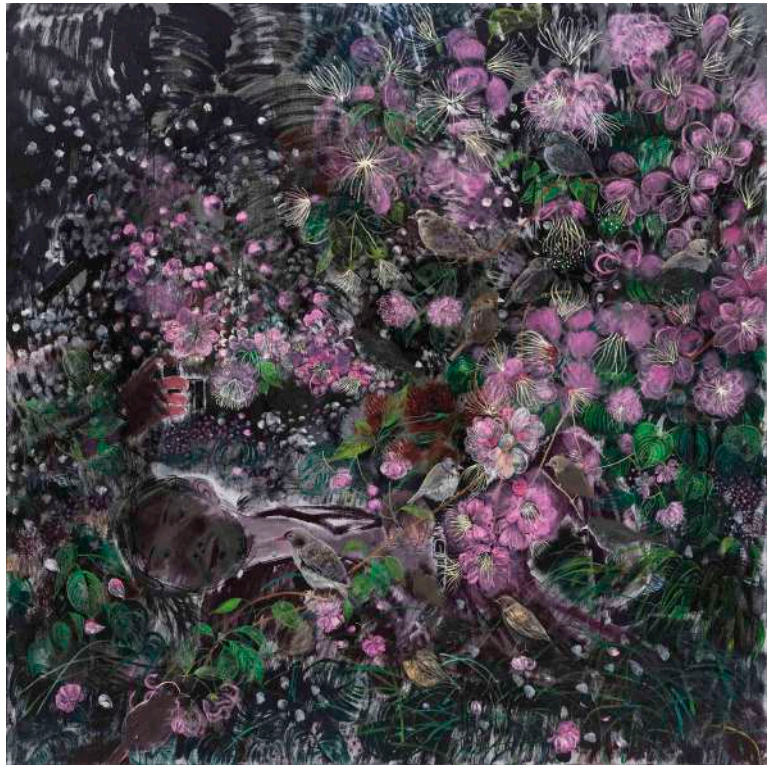
Jealous Night in Flowery Wind No. 1 , 200 x 200 cm, oil on canvas, 2017 《一夜妒花風 -1》, 200 x 200 cm, 布面油畫, 2017

Her drawings seem to have a free and lighthearted innocence, and a spontaneous sense of chance and fragmentation. The trivial minutiae of everyday life often appear in her drawings. Animals and plants, housewares and studio tools, intimate friends, strangers encountered in a coffee shop or on the street, old photographs, decorative items, home furnishings, birds resting on branches in a garden, and portraits of her spouse or friends - all of this is layered in a very unusual, fresh way that breaks through genre hierarchies. This infinite array of things is fully incorporated into an extremely personalized, fictional, and almost fairytale micro-universe with an emotional continuity that is, as a result, imbued with a sense of poetry. This obvious, poetic coherence stems from the depth and strength of the artist's personal emotional relationships to fast-changing, fragmented microscopic realities.