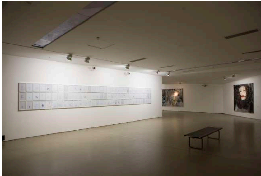
Exhibition view, Today Art Museum, Beijing, 2010 展覽場景圖，今日美術館，北京，2010