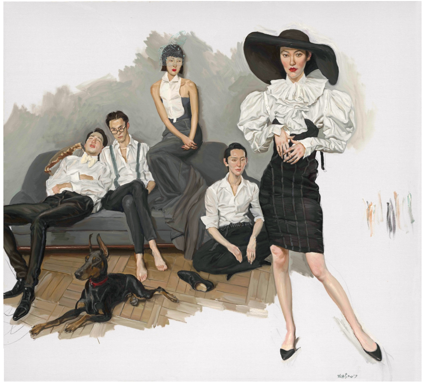
White Shirts , 210 x 230 cm, oil on canvas, 2017 《白襯衫》，210 x 230 cm，布面油畫，2017

The medium of painting allows Chen Danqing to orchestrate the viewer's interaction with work, therefore producing a flow of pictorial associations. According to the artist, "key elements of painting include composition, colour, genuineness, rhythm and idea development. Painting definitely has limits, you cannot release yourself through the process of painting. Painting can no longer provide so-called 'nutrition', which is why I do not care about what I do. In this sense, all the people that are still into painting are immoderate."