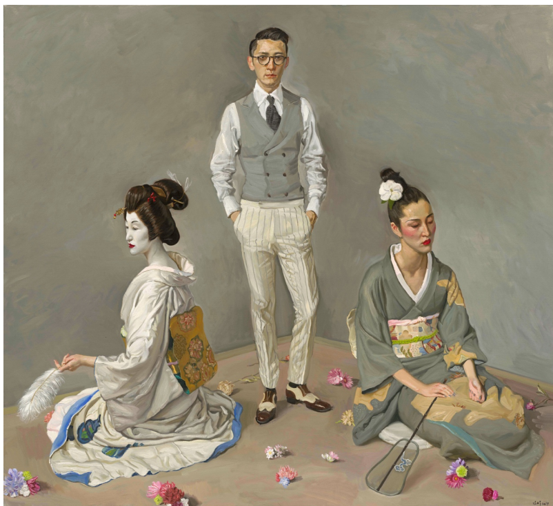
Artificial Flowers , 210 x 230 cm, oil on canvas, 2017 《假花》，210 x 230 cm，布面油畫，2017