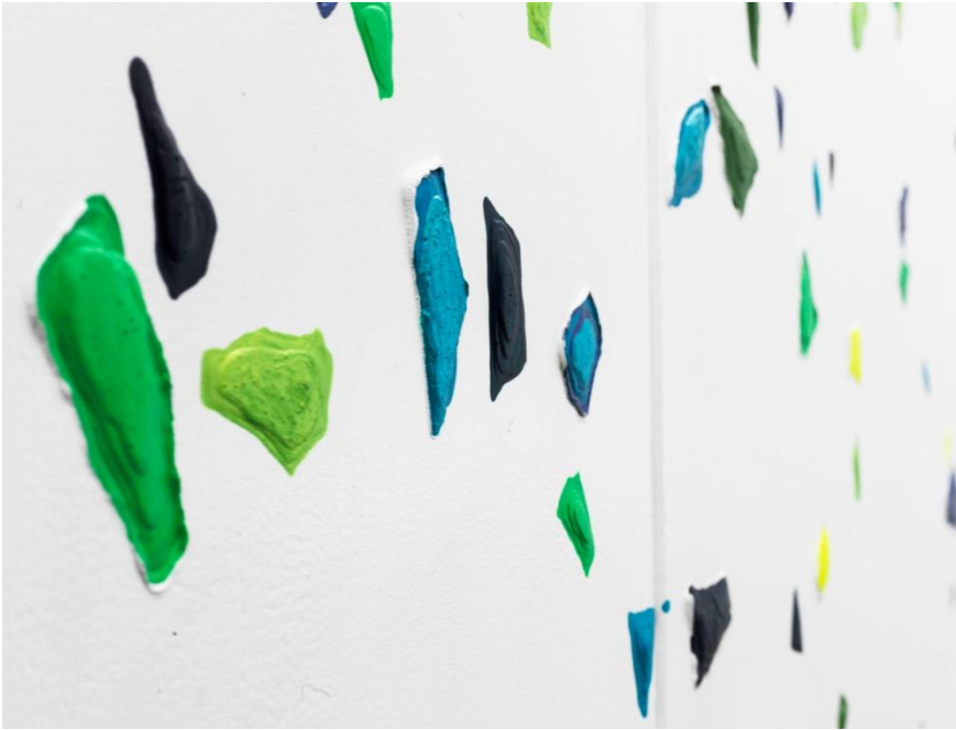
Detail: Thrown into the Air No. 2