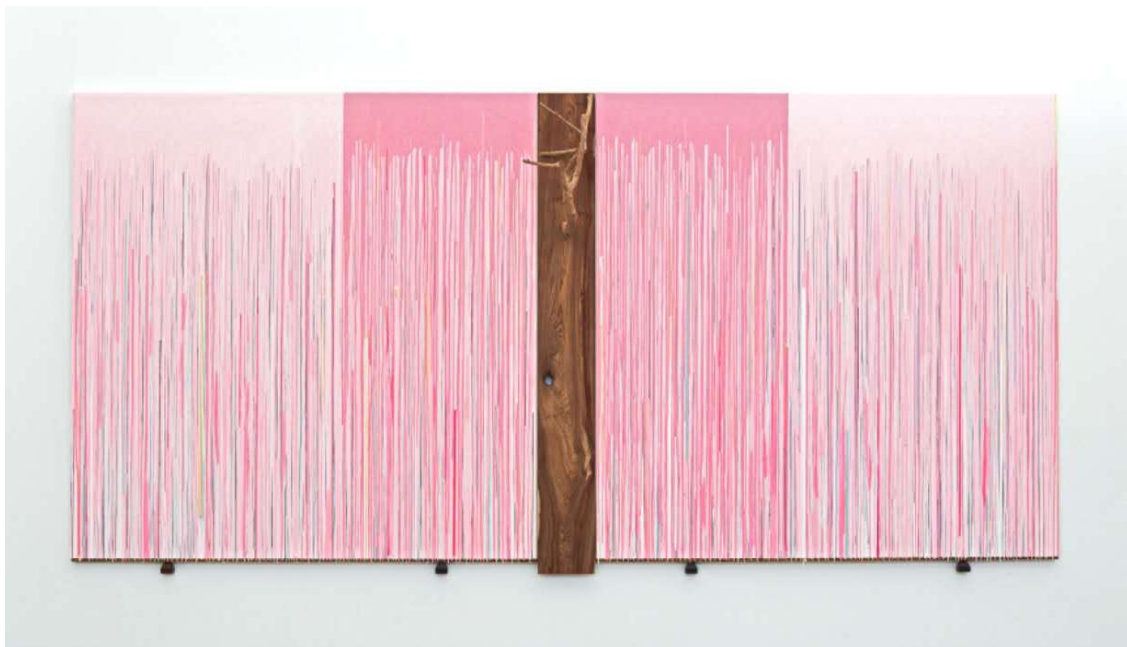
Image: Imprecise Landscape No.6 , 200 x 4500 x 34 cm., Mixed media and acrylic on canvas, longan branches, and rosewood, 2016 – 2017.

changes are also influenced by history, real structures, and cultural demands from his surroundings. As a result, Chen has the experience and observed his own evolution: "This space is not simply physical, it is more of a psychological migration. The dimensions of physical space cannot be changed, but we can attempt to change our own mental and spiritual spaces."