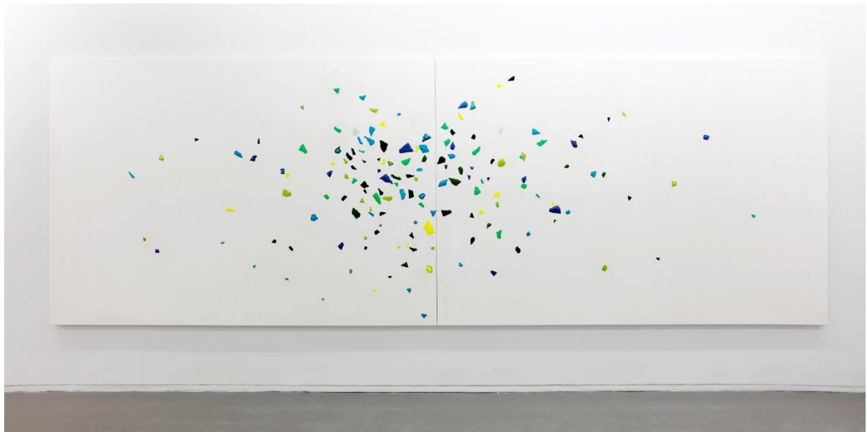
Image: Thrown into the Air No. 2 , 150 x 20 x 14 cm. (200 x 300 x 5 cm. , 2 paintings), Mixed media and acrylic on canvas, neon lights, metal frame, 2015 – 2016.

Tang Contemporary Art Bangkok is proud to present Chen Yufan's Solo Exhibition in Bangkok. This exhibition is an important overview of Chen's work over many years and over the course of his career, highlighting both of his classic works as well as his more recent mixed media and installation works. Some notable pieces showcased will include Becoming One , Derivative , Real Facade , Ideal Place , Cut Landscape , Imprecise Landscape , Thrown into the Sky , 3998 , and Source , which reflect the artist's multi-layered visual and spiritual realms - transforming form to medium, concept to the method, and material to space.