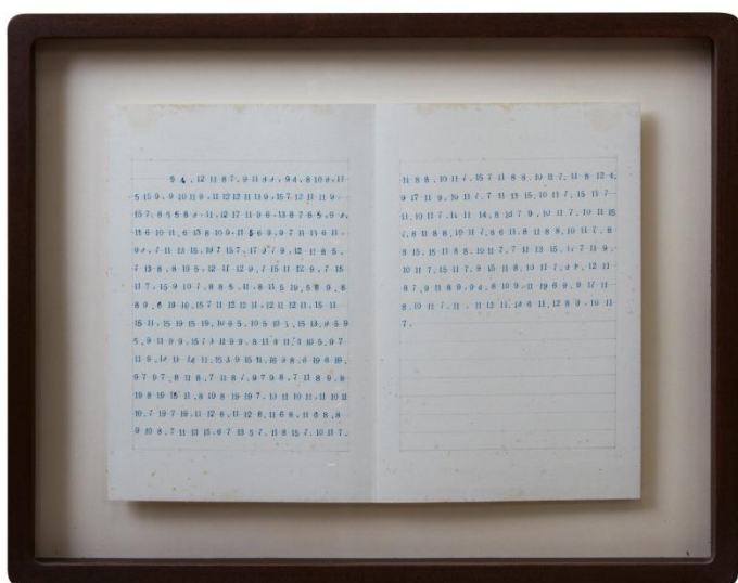
Detail: Incantation of Great Compassion , 56.5 x 44 cm (paper), Mixed media and acrylic on canvas, mixed media on paper, 2015.

The fluid spatial realms presented in Chen's work invite the viewer into an open vision, which exists in the present, yet requires embedding oneself in history or a temporal-spatial setting. Chen's work shows us an artist's creative evolution, while also providing a broader spiritual outlook. In essence, the course of human existence is a river that brings together disparate elements and is constantly changing, and every living being wandering in it can uncover great wisdom and passion.