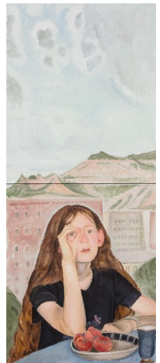
Gazing , Oil on canvas 120 x 50 cm, 2023

When faced with different themes, You Yong always seems to find a way to connect his awareness of the issues with individual experiences. Works such as "Home at the table", "Stay alone together", and "Drawing of restless and whimsical" were reference to