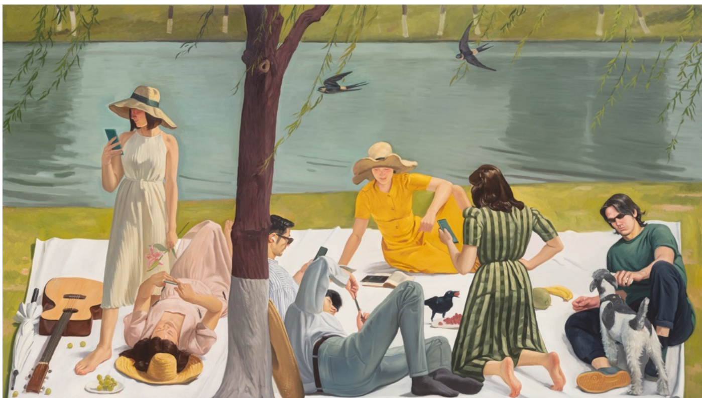
Stay alone together , Oil on canvas, 180 x 320 cm, 2023