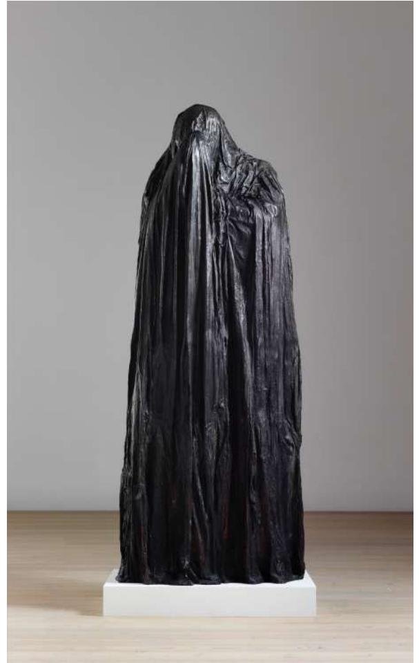
Todesfigur , bronze, 185 x 77 x 57 cm, 2018 《完形》，銅，185 x 77 x 57 cm，2018