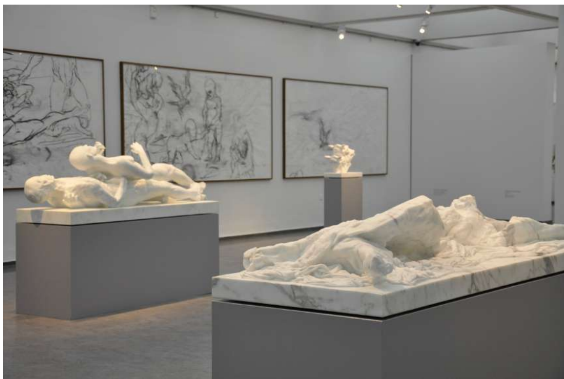
Lust , Randers Art Museum, Denmark, 2017 《Lust》, 蘭德美術館, 丹麥, 2017

Special acknowledgments to Khora Contemporary for their support on the VR work.