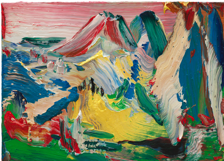
Landscape , oil on canvas, 50 x 70 cm, 2019 《江山》 | 布面油畫 | 50 x 70 cm | 2019