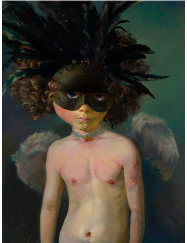
Chen Hui 陳卉, The Pearl 珍珠 Oil on Canvas 布面油畫, 75 x 57 cm, 2011

Compared to Xia Xiaowan’s pieces, Chen Hui’s work presents the spectacle of another glittering world. The artist excavates the present consumerist era for real states that have been obscured by the shiny exteriors of modernity; using realistic yet highly dramatic methods, she merges the external surfaces of her subjects with their internal substances. In her Your Portrait series, Chen uses extremely fine, delicate brushstrokes to explore and probe the universal theme of portrait painting, depicting what is hidden beneath the surface of everyday life and giving clues to her subjects’ spiritual and psychological states.